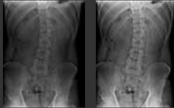
GridON software reduces radiation scatter when a physical Grid is not available